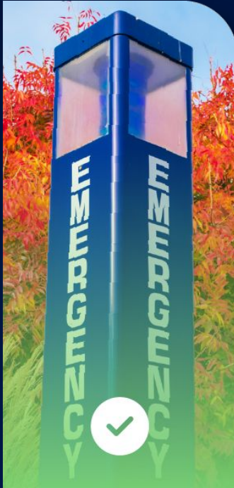
Blue Light Phones